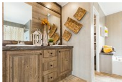
THE BREEZE II Floor plan number: CS2020447TNAB 4 beds • 2 baths • 2128 sq.ft. • 28' width • 76' depth